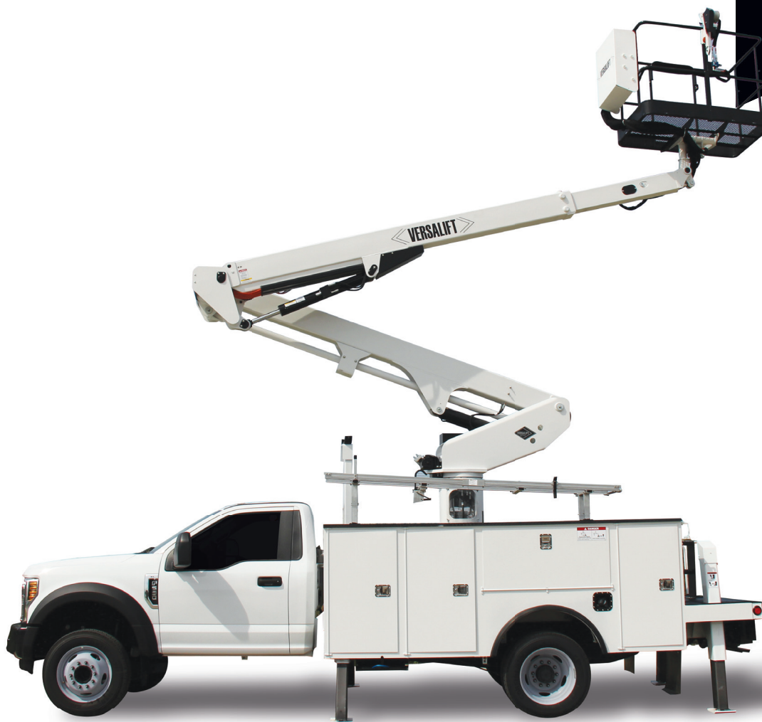
VST-50-TN model shown here.

LARGE TOP-MOUNTED STEEL PLATFORM 36 IN X 60 IN X 43 IN