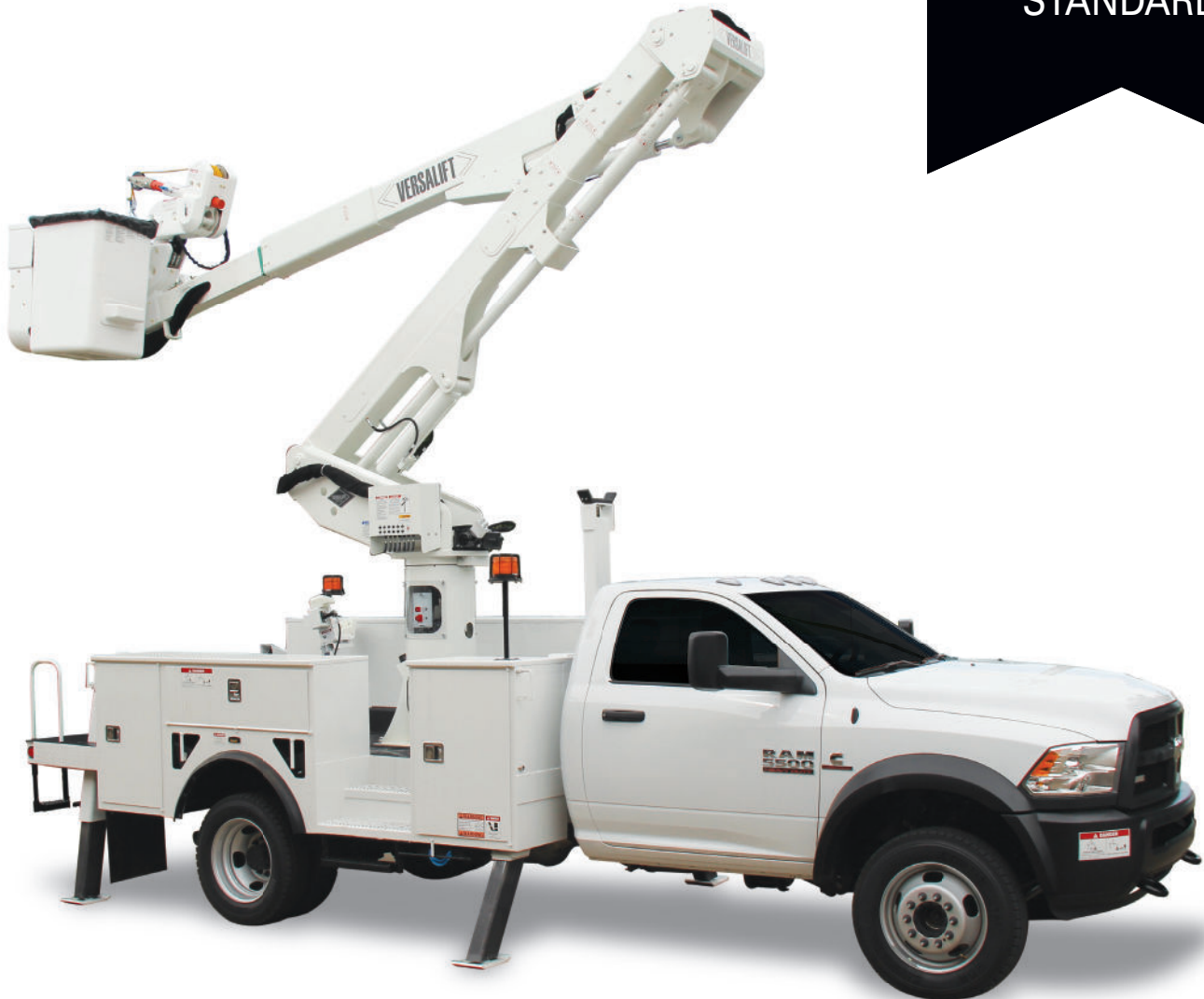
VST-47-I shown with Material Handling option.