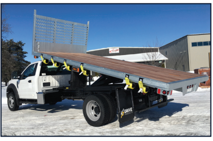
GALVANIZED STEEL WITH WOOD FLOOR

The ideal team member for anyone in the lumber or home building industry, Voth's dumping flat deck is available in steel, aluminum, or galvanized steel with apitong wood floor. Make lumber deliveries a breeze with the optional rear roller.