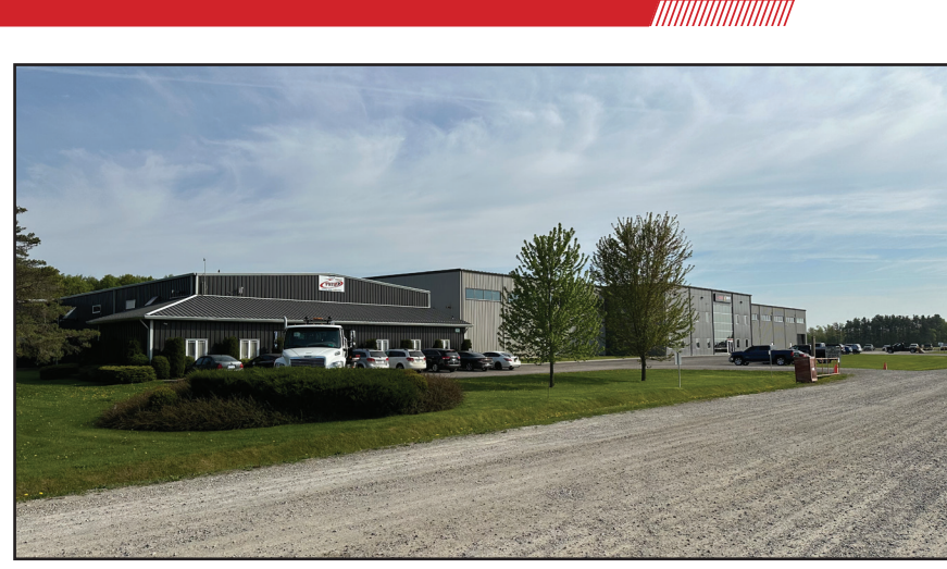
Voth Courtland Manufacturing Facility: 92,000 sq.ft