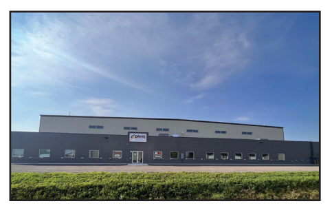
Morden Manufacturing Facility: 56,000 sq. ft