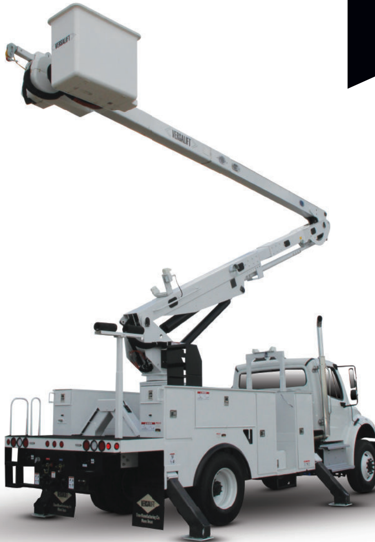
VN-555-MHI model shown here.