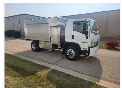
Padboxes for wood planks