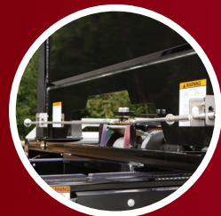
DUAL MANUAL FREE- SPOOL (OPTION)