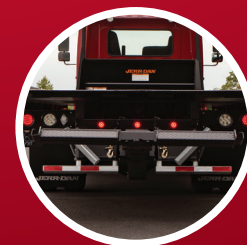
LED DOT LIGHTING