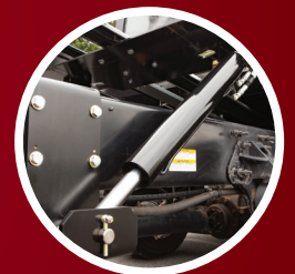
OUTBOARD TILT CYLINDERS