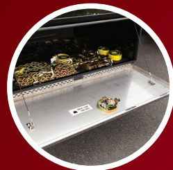
STANDARD TIE-DOWN KIT