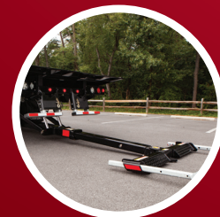
3K LB UNDERLIFT WITH GALVANIZED L-ARMS