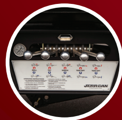
DUAL LIGHTED CONTROL STATIONS