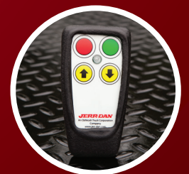
REMOTE CONTROL (OPTION)