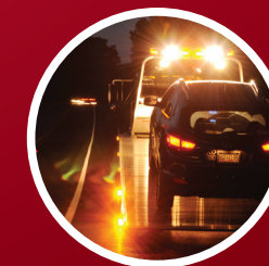
RAIL LIGHTING (OPTION)